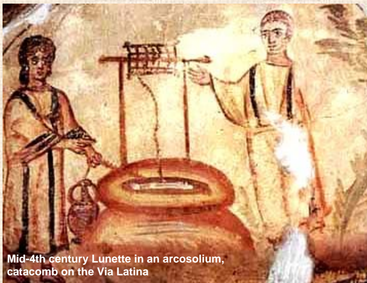
Mid-4th century Lunette in an arcosolium, catacomb on the Via Latina